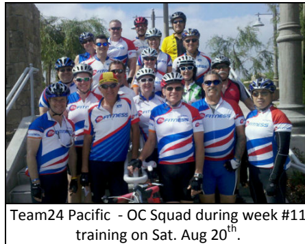
Team24 Pacific - OC Squad during week #11 training on Sat. Aug 20 th .