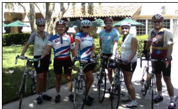
Team24 Pacific – SD Squad enjoying a beautiful ride throughout the North County areas of San Diego!

If you haven't started on your training, now is the time to get your bike from out of that bike stable of yours and get it checked out at your favorite bike shop! Once your mechanic gives it the big OK, you are ready to tackle the miles with us toward a FABULOUS event in October. Once you ride with our team, you will be hooked as the camaraderie and companionship of our cycling team will keep your motivation alive as you melt those miles away during your journey with us. That, plus the beautiful scenery we ride through makes it an AWESOME day to remember during your training days. So, grab your bike and get ready for a GREAT adventure as we prepare you for the MS Bike Tour in October!